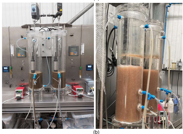
Fig 1. Schematic representation (a) and photographs (b) of the AGS-SBR system for wastewater treatment during idle (left) and reaction (right) phases.

As a first approach, the AGS-SBR technology was applied to the treatment of simulated municipal wastewater in close collaboration with the Federal University of Santa Catarina, Brazil. This study investigated the effects of the carbon-to-nitrogen (C/N) ratio on AGS using two identical biological reactors (C/N = 5 and C/N = 10). After 84 days of operation,